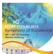
Sponsorship Opportunities (1201 KB)