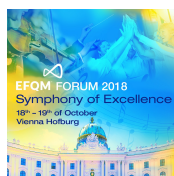
Invitation EFQM Forum (1 MB)