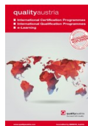
Folder International Training Programme (6.8 MB)