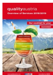
Overview of Services 2018 - 2019 (5 MB)