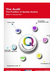
Position Paper "The Audit" (3 MB)

qualityaustria Videoclip: Invitation from Raphael von Hoensbroech